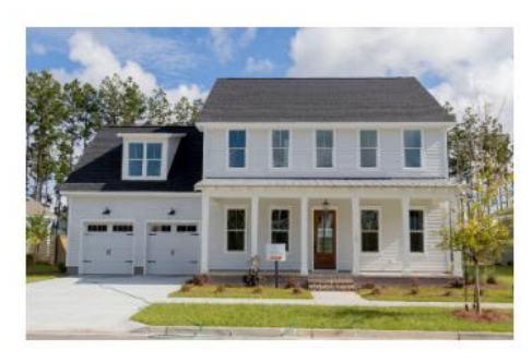
AZALEA - LOT 923 BY HOMES BY DICKERSON

4 Bed | 2.5 Bath | 3,079 sq.ft. $821,360