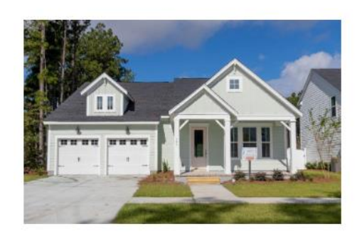
LINDLEY - LOT 935 BY DAVID WEEKLEY

If this is music to your ears, check out these Nexton homes for the rarin' to go.